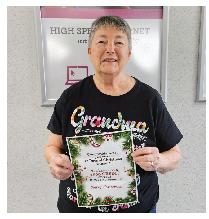
Congrats to all the winners!