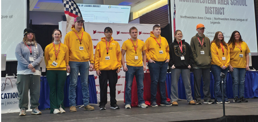
Pictured from top to bottom are the esports teams from Warner Area, Northwestern Area, and Aberdeen Central High Schools on stage at the state tournament. Congratulations on your season!